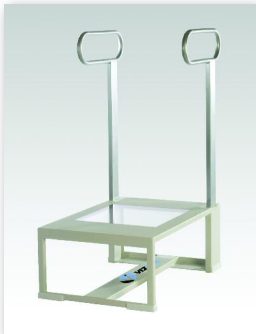
WEIGHT BEARING STAND