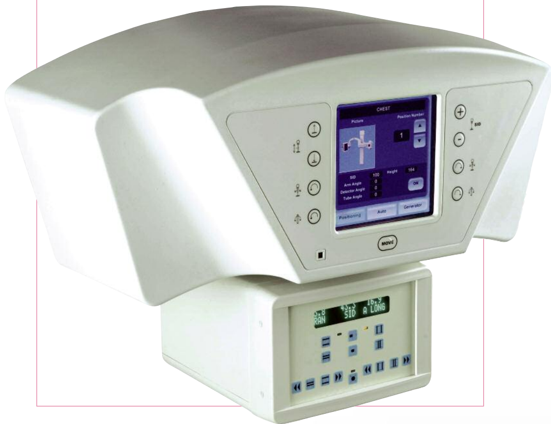
Table Side Control