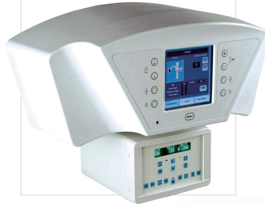
Table Side Control

The Collimator features linear laser beam with light field indicator for optimal patient positioning.